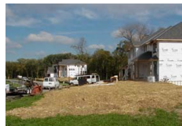
Mulch and Seed