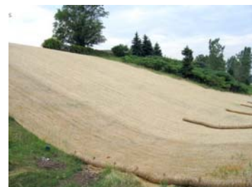
Erosion Control Blanket