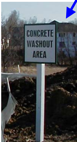
Designated Concrete Washout Areas with a Rock Entrance