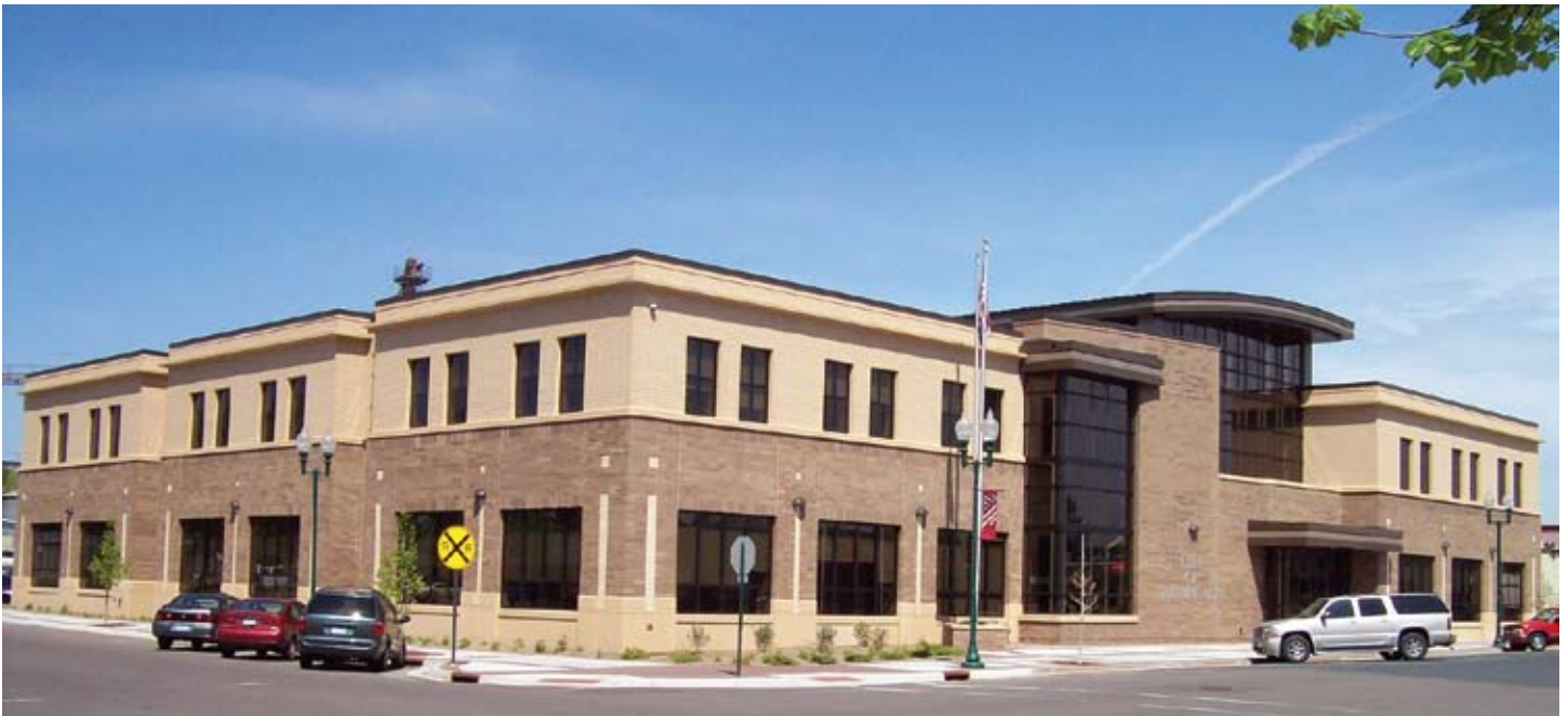
Farmington City Hall, 430 Third Street